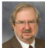
PROFESSOR AND CHAIR James P. Allison, Ph.D.